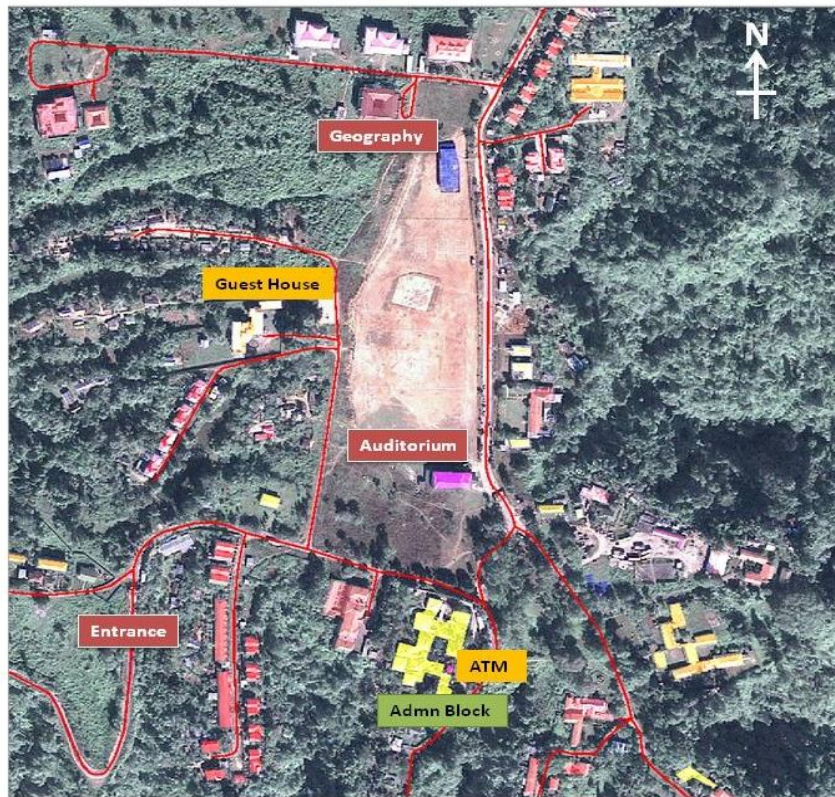
Fig.3. Map of Rajiv Gandhi University Campus.